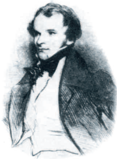
Mérimée as a young man, from a study by Deveria

minded, to train the spotlight away from Carmen and onto the downfall of Don José.)